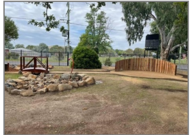
Above and right: Award winners and paintings at the Textures of One exhibition and (far right) Blayney Public School sensory garden.