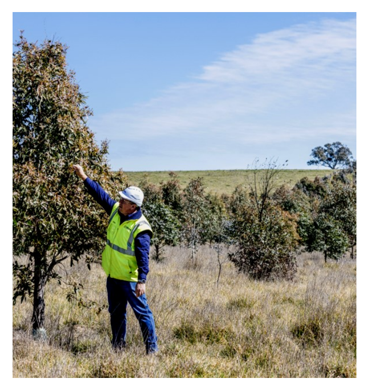
Above: Some of the 6,500 native trees already planted by Regis to improve corridor connections between wildlife habitat areas and create visual screening.

• The revegetation project will aim to reconnect fragmented patches of koala habitat surrounding the mine and create corridors to link with larger areas of native vegetation to the north and east.