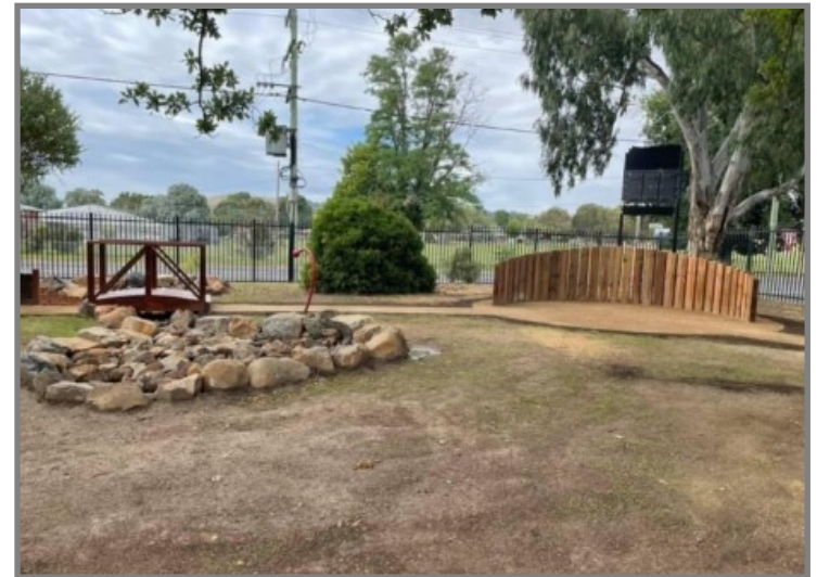
Above and right: Award winners and paintings at the Textures of One exhibition and (far right) Blayney Public School sensory garden.